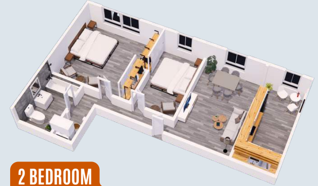
2 BEDROOM 1 BATHROOM

FLOOR 1 TOTAL AREA, SF 410 SF BEDROOM 1 PARKING YES BATHROOM 1 STARTING PRICE