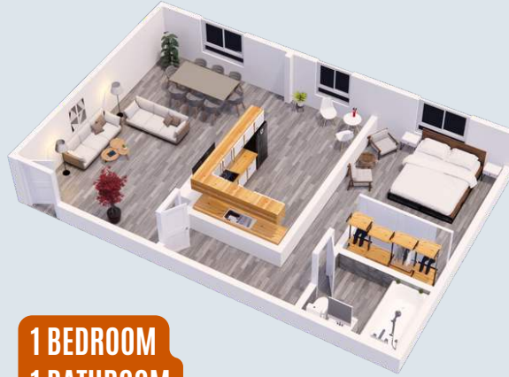
1 BEDROOM 1 BATHROOM